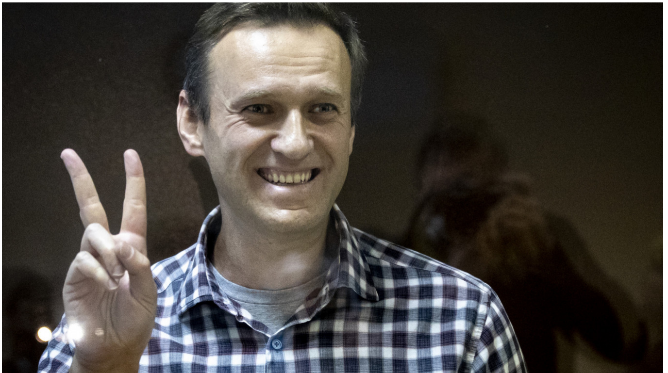
Alexei Navalny

Kremlin critic Alexei Navalny, who is serving a two-and-a-half-year jail term in a penal colony outside Moscow, on Monday compared his daily routine in prison to that of a stormtrooper in Star Wars.