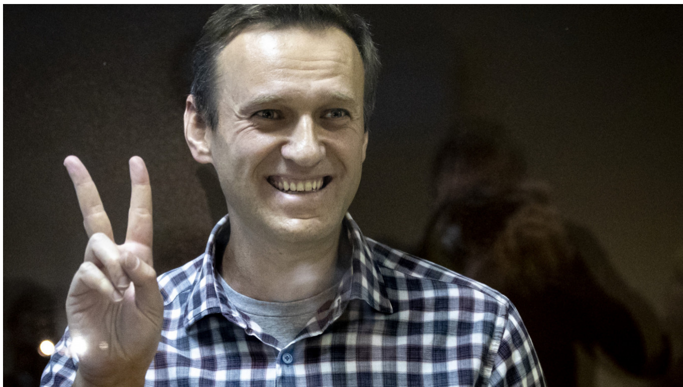
Alexei Navalny

Kremlin critic Alexei Navalny, who is serving a two-and-a-half-year jail term in a penal colony outside Moscow, on Monday compared his daily routine in prison to that of a stormtrooper in Star Wars.