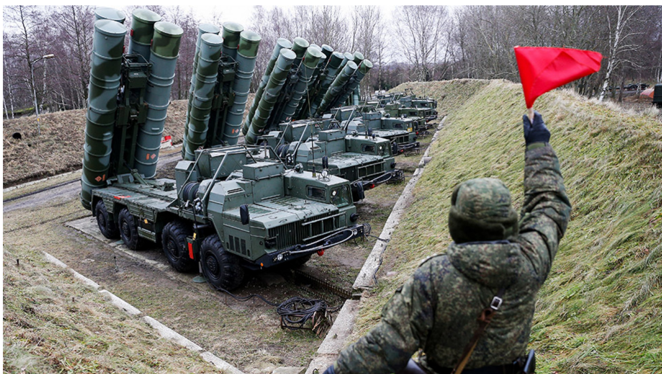
S-400 missile defense systems