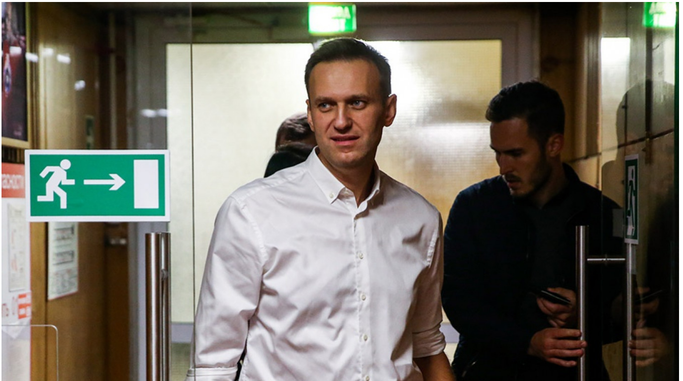
Alexei Navalny

Update: Navalny reported Wednesday morning that he had been allowed to leave the country after paying a 2.1 million ruble court fine that had formally barred him from leaving Russia. The activist insists that he had not been informed of the fine when it was posted on Nov. 9 and has vowed to sue the Federal Court Marshals Service over what he called "illegal actions."