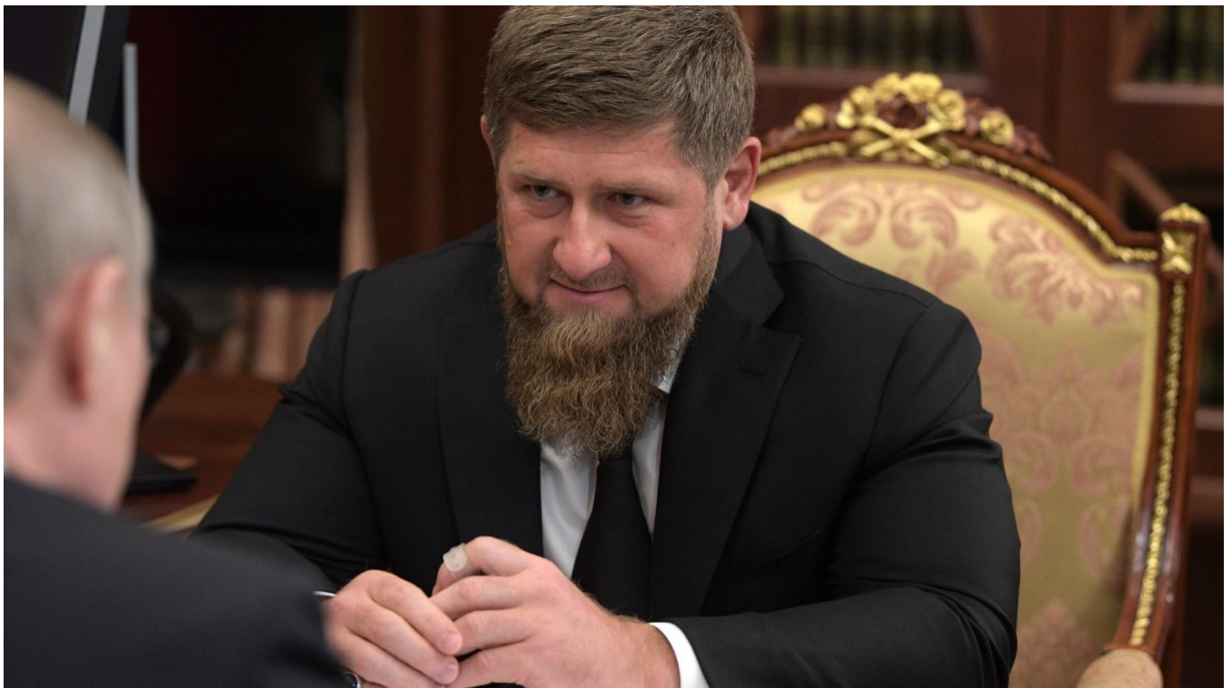
Ramzan Kadyrov

Ramzan Kadyrov, the leader of Chechnya, has dismissed his designation as a human rights abuser by the U.S. and argued that he was blacklisted because of his efforts in combating terrorism.