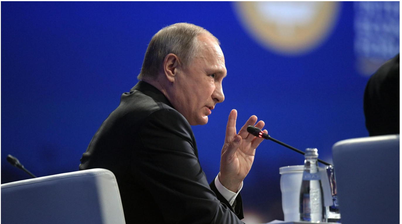
Vladimir Putin

Russian media has found a way to give a positive twist to a new survey produced by the Pew Research Center reporting low trust in Russian President Vladimir Putin globally.