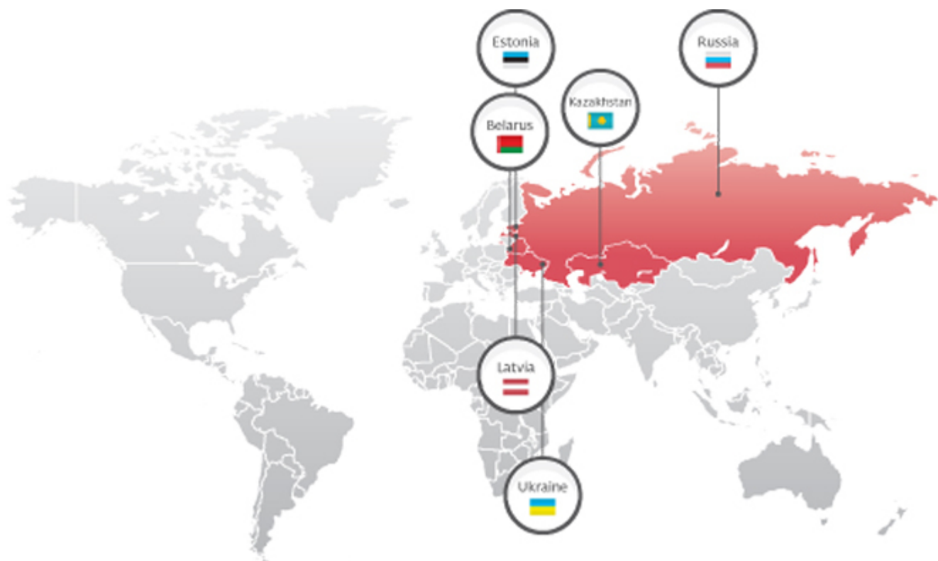
Countries Where Prisma Ranks No. 1

Another reason why the app has gone viral so quickly is because its user base has become an unpaid advertising army. The Prisma hashtag is optional when sharing a photo to social media. And yet #prisma on Instagram was approaching 500,000 results as fans use the hashtag in order to draw attention to their individual "works of art."