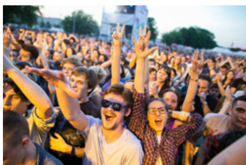
Bosco Fresh Fest

Bosco Fresh Fest has moved to VDNKh and expanded to three stages. The first day’s headliners are Mumiy Troll, probably the most popular Russian rock band and New York hip-hop diva Azealia Banks. On the second day you can check out Ivan Dorn’s new concert program with a Dixieland band and Tesla Boy. You can also see Skriptonit, a rising rap star from Kazakhstan and Brainstorm from Latvia, as well as electronic pioneers GusGus from Iceland and Kwabs, British Ghanaian singer, who authored ubiquitous hit “Walk.” Moscow indie scene regulars On-the-Go, Pompeya, and Tesla Boy will be there as well.