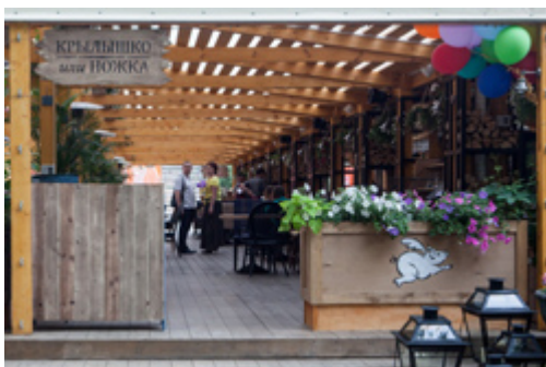
Wing or Leg