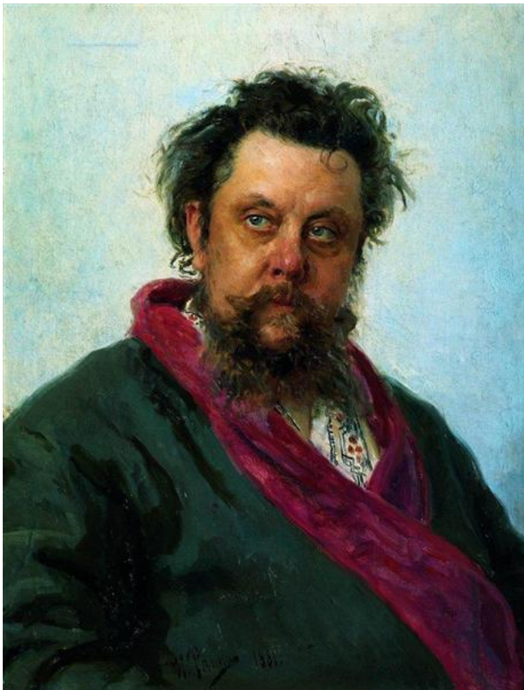
National Portrait Gallery

The paintings not only document the cultural behemoths of the era, but also demonstrate how Russian portraiture transitioned from striking realist techniques to the bolder and colorful styles of Russian Symbolism and Impressionism.