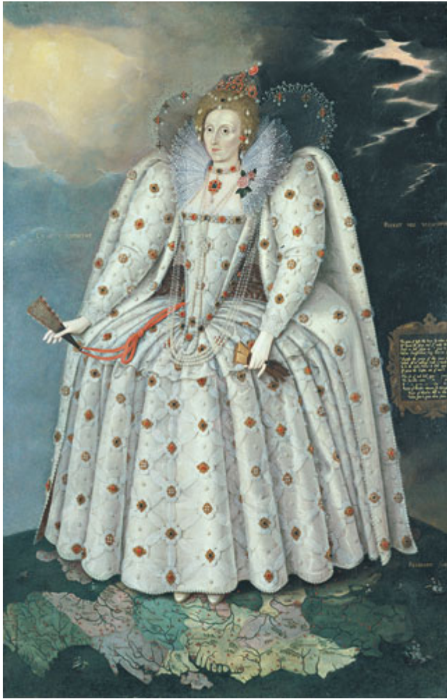
National Portrait Gallery

Queen Elizabeth I ('The Ditchley portrait') was painted by Marcus Gheeraerts the Younger in about 1592.