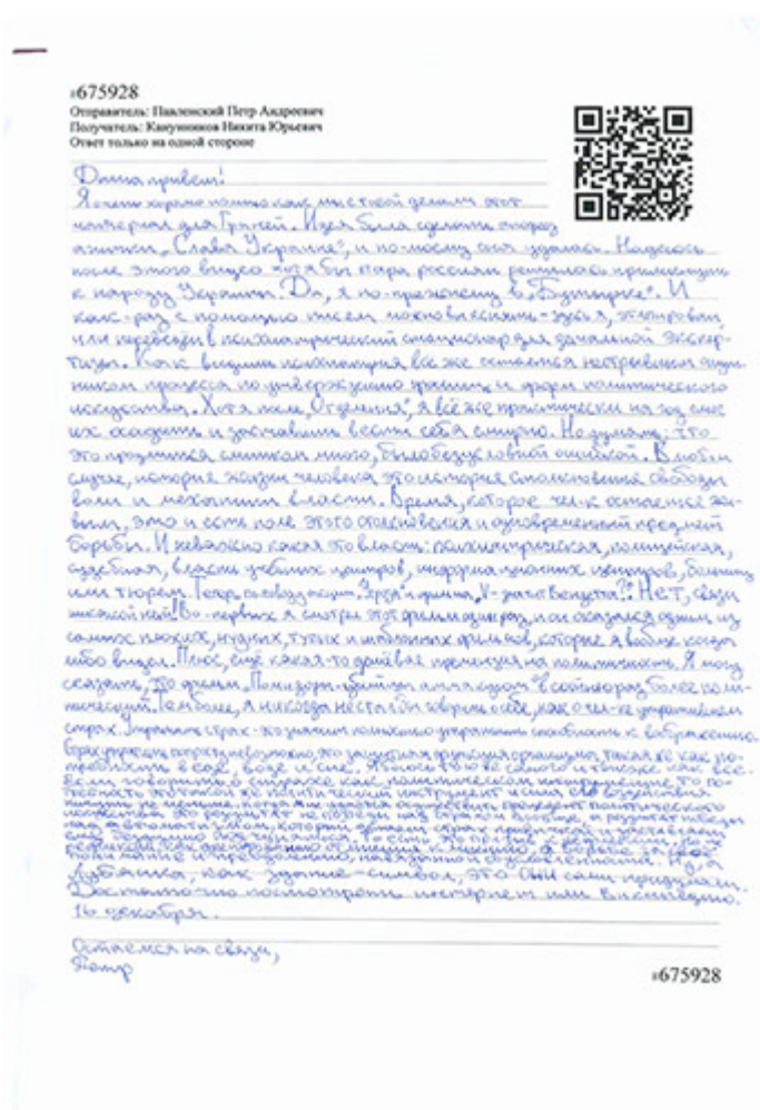
A letter by political performance artist Pyotr Pavlensky. View in higher resolution here .

In total, RosUzник delivered about 2,000 letters last year.