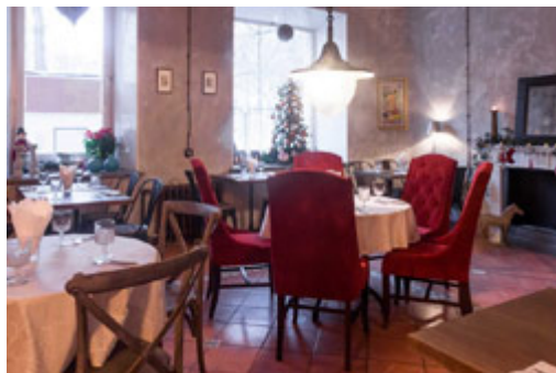
Yest Khinkali, Pit Vino