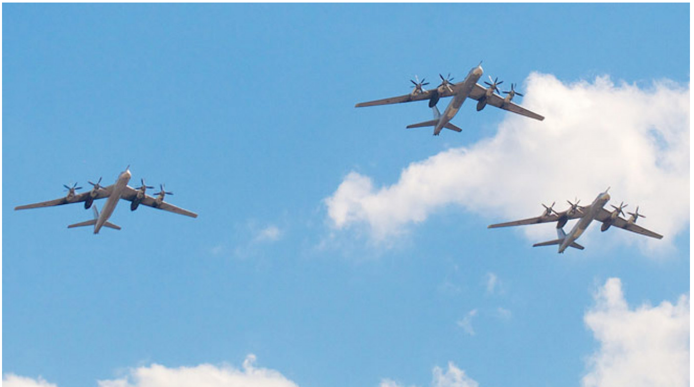
Russian Tu-95 strategic bombers

Russia is gradually being drawn into an extended campaign in Syria. Over the past month, the military has deployed new aircraft, new air defense systems, and is reportedly moving into two previously unused Syrian airbases to increase its support for the embattled regime in Damascus.