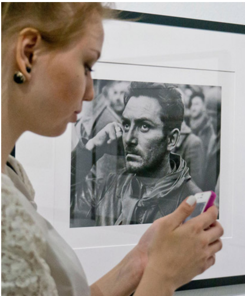
Vladimir Filonov / MT

He had vowed to give up war photography but nevertheless went to Vietnam to cover the war between the French colonial forces and Vietnamese independence fighters in 1954. He died after stepping on a land mine and was buried in the United States.