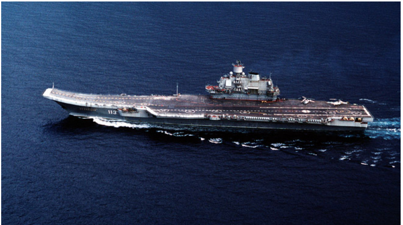
Admiral Kuznetsov aircraft carrier

Russia wants to join the global club of naval powers wielding large and powerful aircraft carriers, but such a project is decades away and would require major expansion of Russia's industrial capabilities and changes to the way the country uses its navy.