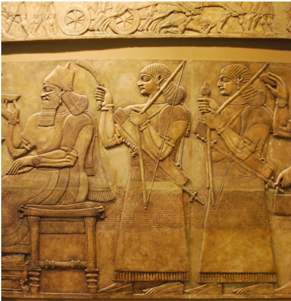
Layli Foroudi / MT

Nimrud, an ancient city on the river Tigris founded in 13th century B.C., was bulldozed, with many of the ruins destroyed. The Mosul Museum, Iraq's second-largest museum, was raided by militants and the contents of at least two rooms were destroyed with sledgehammers. The museum held hundreds of artifacts found during a Soviet-Iraqi archaeological expedition in Mesopotamia in the 1970s, including a clay oven built in 5th century B.C.