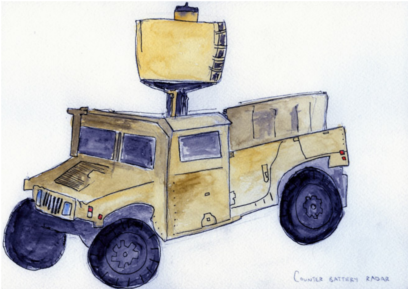
Layli Foroudi for MT

Counter-battery radars would significantly boost Kiev's ability to repulse rebel assaults by rapidly determining the source and location of rebel artillery, mortar and rocket fire.