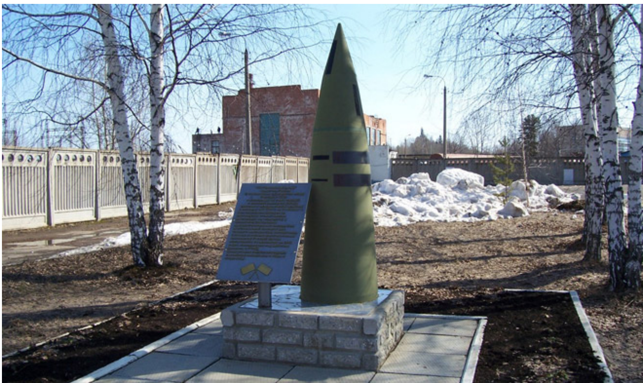
Justin Lifflander / For MT

That finally allowed him to interact with Soviets over the course of a two-year contract in the remote defense-industrial town of Votkinsk.