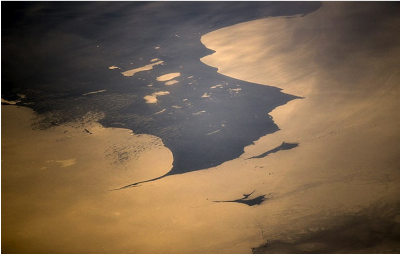
The Volga River delta — the largest river delta in Europe — which opens into the Caspian Sea about 60 kilometers downstream of the city of Astrakhan in Russia's South-West.