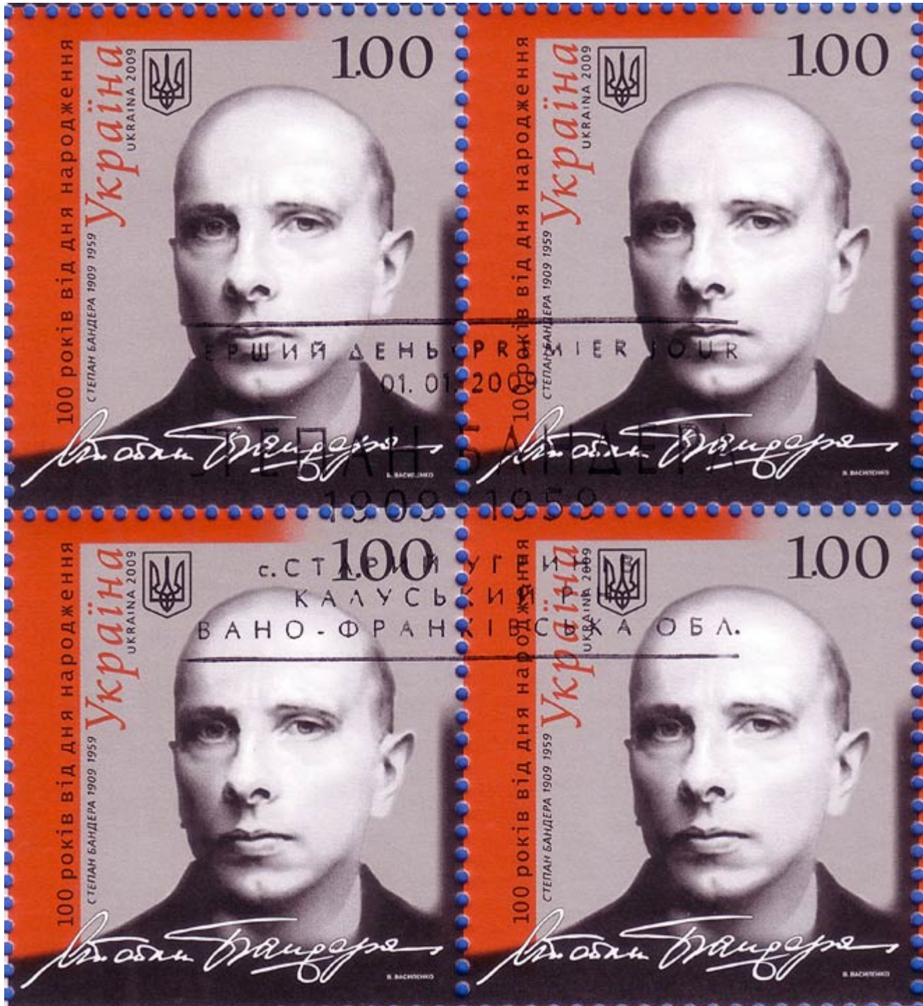
Post of Ukraine

A Ukrainian stamp released in 2009 celebrates Bandera's 100th birthday.