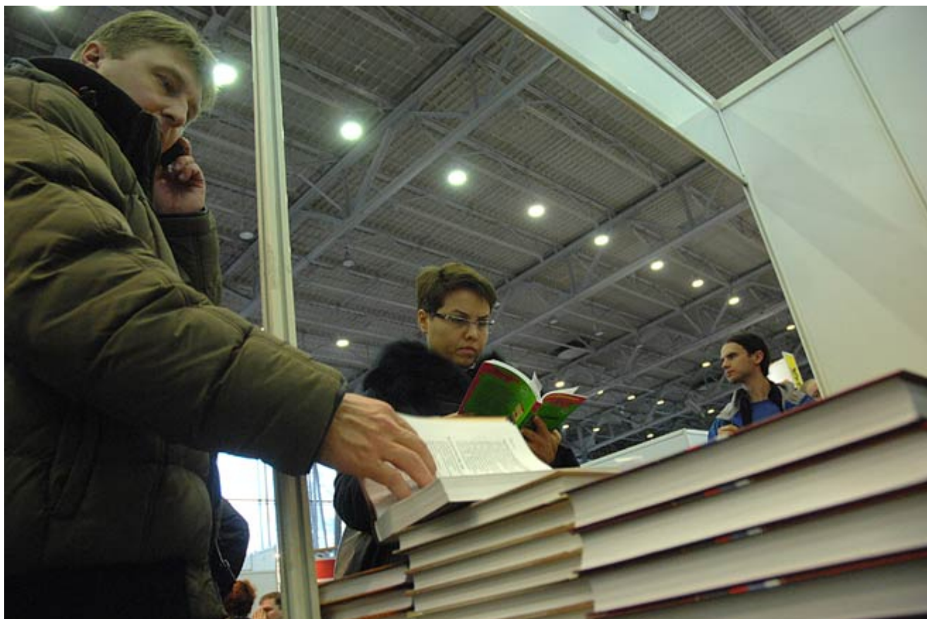
Sergei Porter / Vedomosti

Muscovites browsing at a book fair, a sales model Green Books eschews.