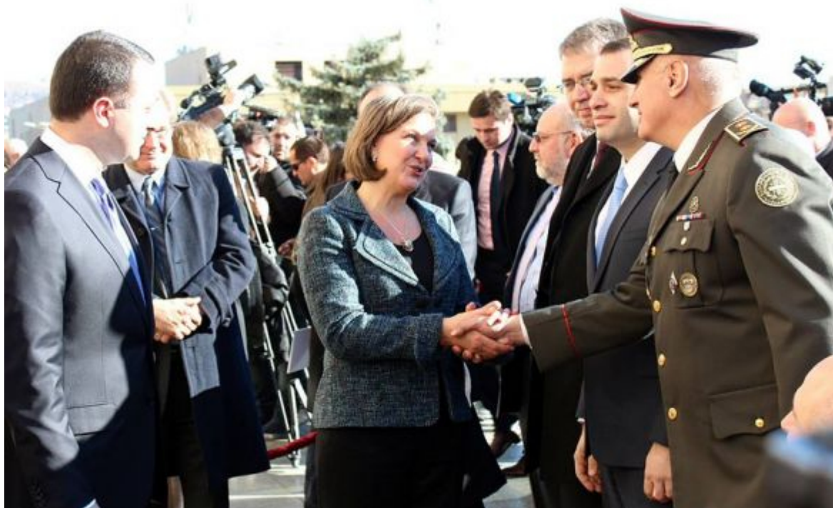
The United States Embassy, Georgia official facebook page.

Victoria Nuland, as assistant U.S. secretary of state in charge of European and Eurasian affairs, already has the right employer for an ambassadorship. A leaked phone conversation last week in which she apparently used a four-letter word to describe the European Union would give her a head start in finding a common language with her Russian counterparts at the Foreign Ministry. Russian diplomats have also expressed frustration with the EU, just not in those words — at least not on tape.