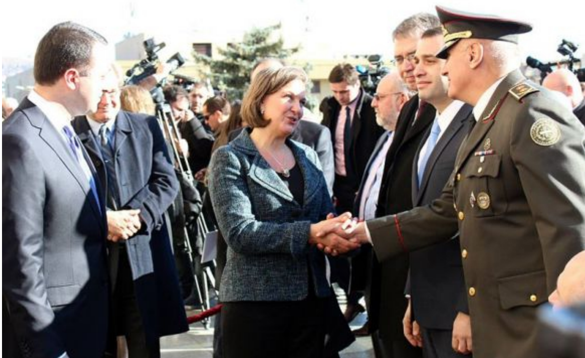
The United States Embassy, Georgia official facebook page.

Victoria Nuland, as assistant U.S. secretary of state in charge of European and Eurasian affairs, already has the right employer for an ambassadorship. A leaked phone conversation last week in which she apparently used a four-letter word to describe the European Union would give her a head start in finding a common language with her Russian counterparts at the Foreign Ministry. Russian diplomats have also expressed frustration with the EU, just not in those words — at least not on tape.