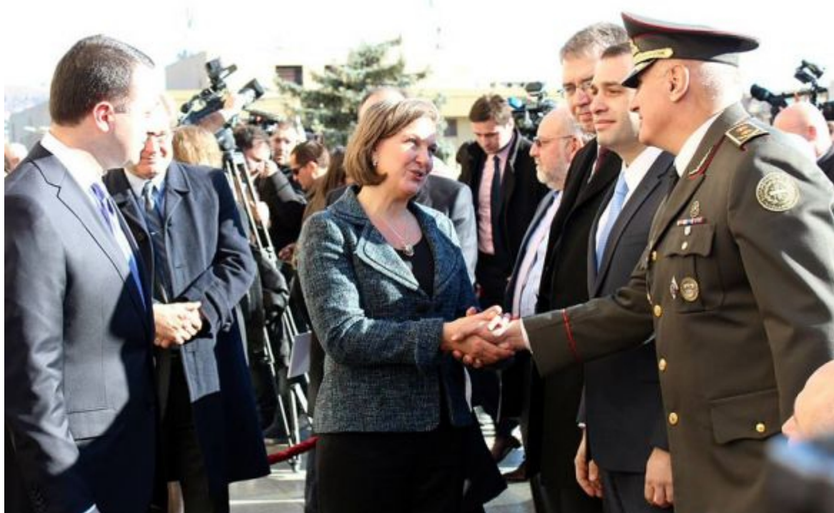
The United States Embassy, Georgia official facebook page.

Victoria Nuland, as assistant U.S. secretary of state in charge of European and Eurasian affairs, already has the right employer for an ambassadorship. A leaked phone conversation last week in which she apparently used a four-letter word to describe the European Union would give her a head start in finding a common language with her Russian counterparts at the Foreign Ministry. Russian diplomats have also expressed frustration with the EU, just not in those words — at least not on tape.