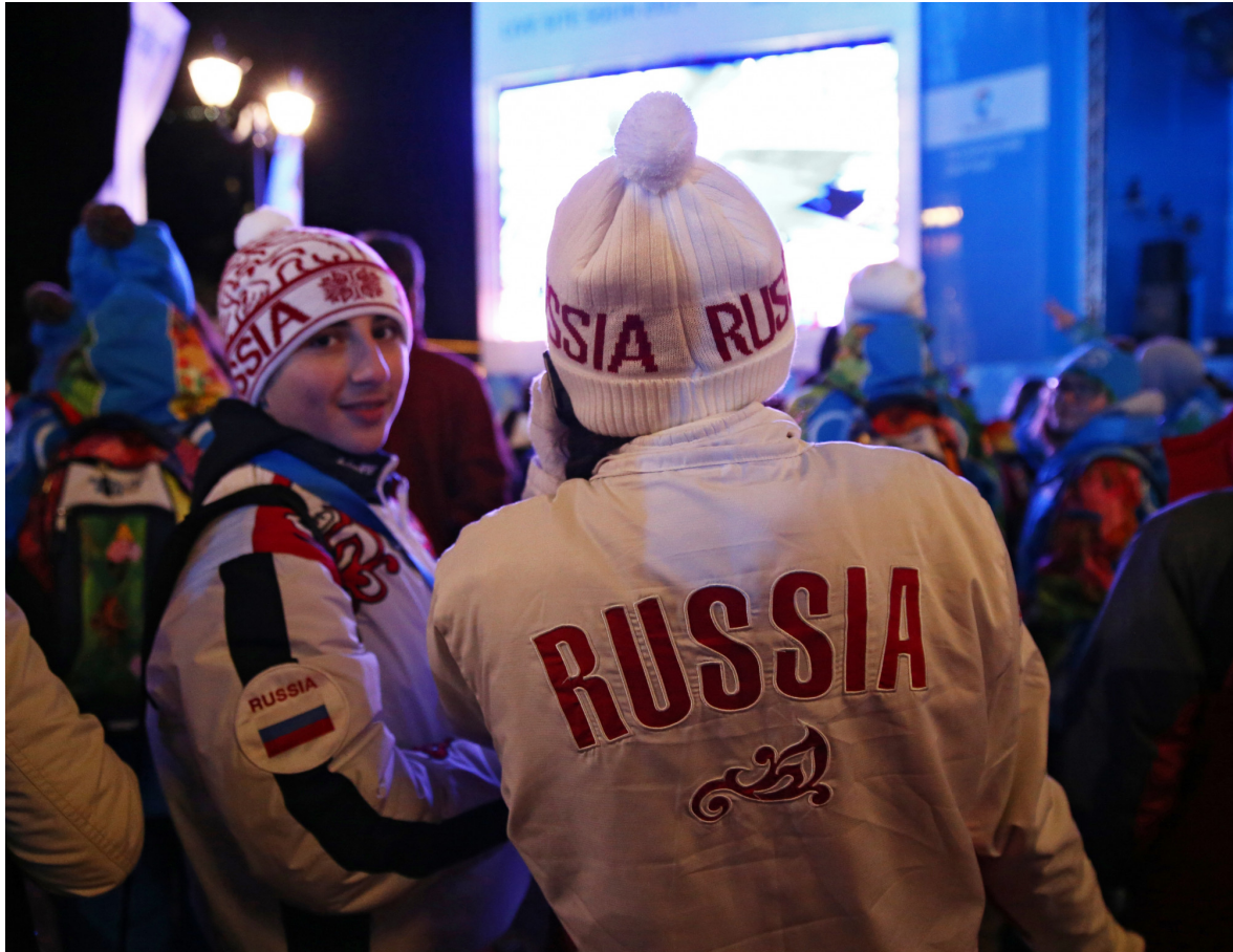
Two boys cheering on the Russian Olympic team during the opening ceremony.

The procession did not go without a fight in the crowd. People had to stand so close to each other that one man thought another man standing near his wife had tried to harass her. He attacked the man and police had to intervene to stop the fight.