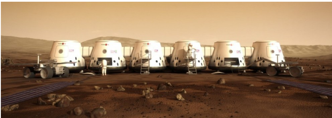
Visual of the first humans landing on Mars in 2025.