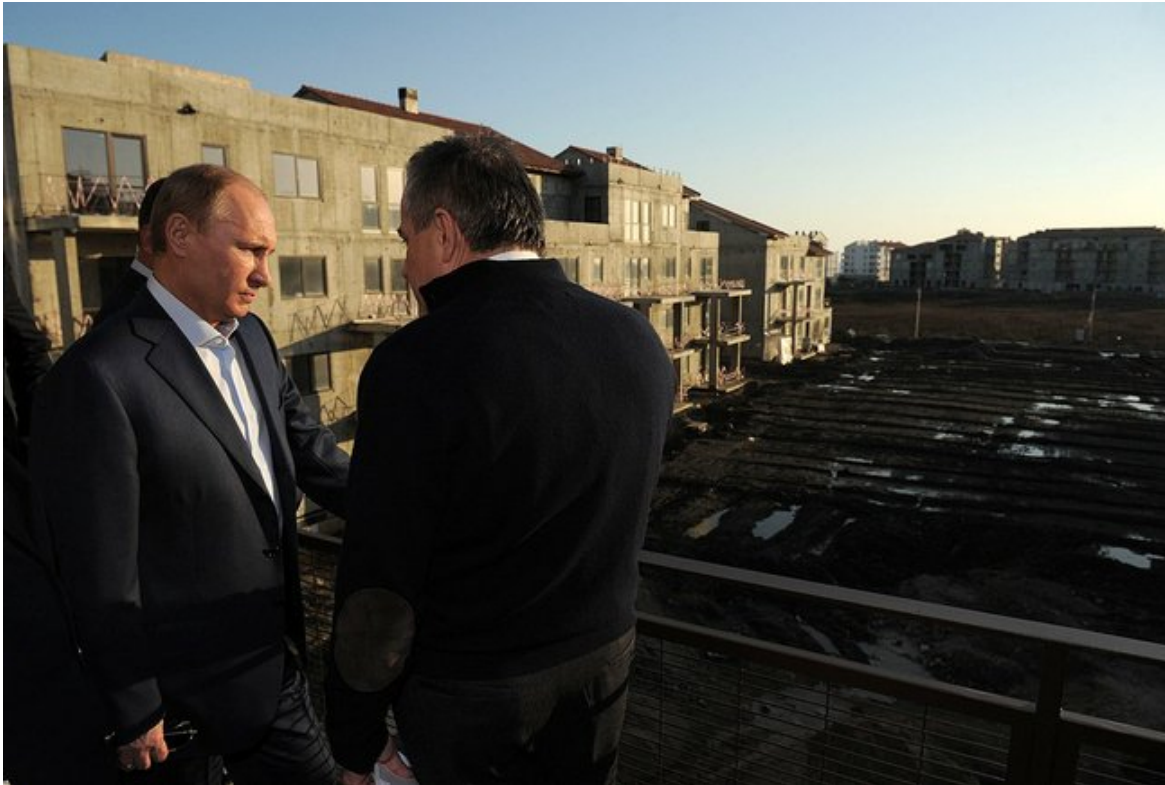
Putin inspecting the construction site of the Olympic village.

Looking over the bobsled track, slated to open in summer 2013, Putin was informed that the track's completion had been initially planned two years prior to that date, and that its cost had jumped from 1.2 billion rubles ($37 million) to 8 billion rubles. State-owned Sberbank, a shareholder in the Krasnaya Polyana complex, which the track is part of, would have to fork out the additional funds.