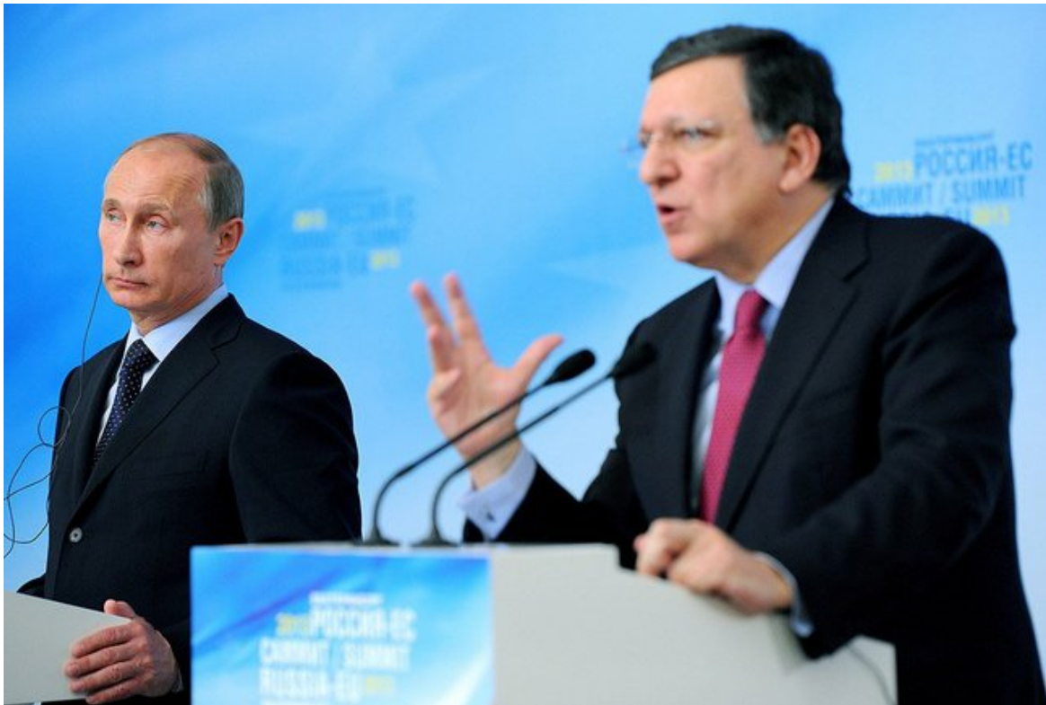
Putin and European Commission President Jose Manuel Barroso at a press conference following the summit.

The two parties went into the meeting with high hopes of a visa-free travel agreement between Russia and the EU and an understanding on how to solve the conflict in Syria.