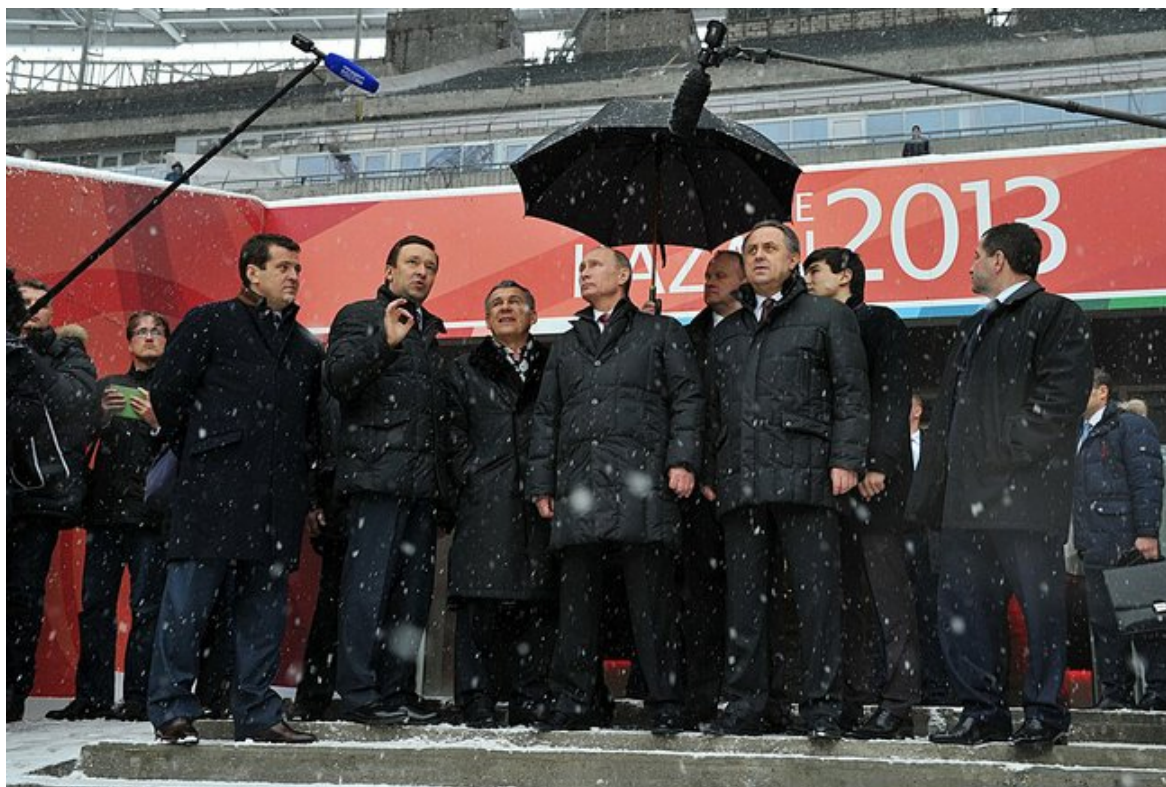
Putin posing after an inspection of the construction site of the Kazan arena.

The cost of preparations for the student Olympic Games is estimated at $4.5 billion to almost $7 billion, depending on the source.