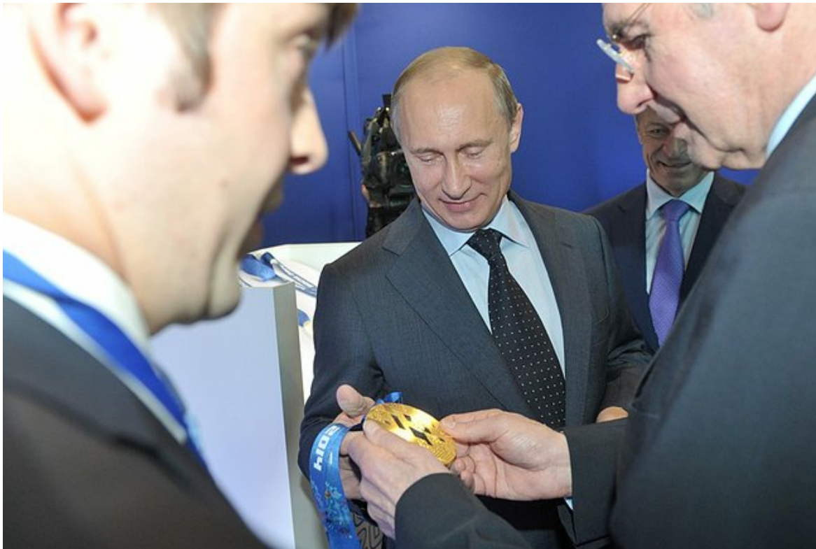
Putin inspecting the medals to be awarded at the Olympic and Paralympic Games in Sochi.

Putin discussed with IOC members the design of the medals for the Sochi Olympics and the events to be included in the Games.