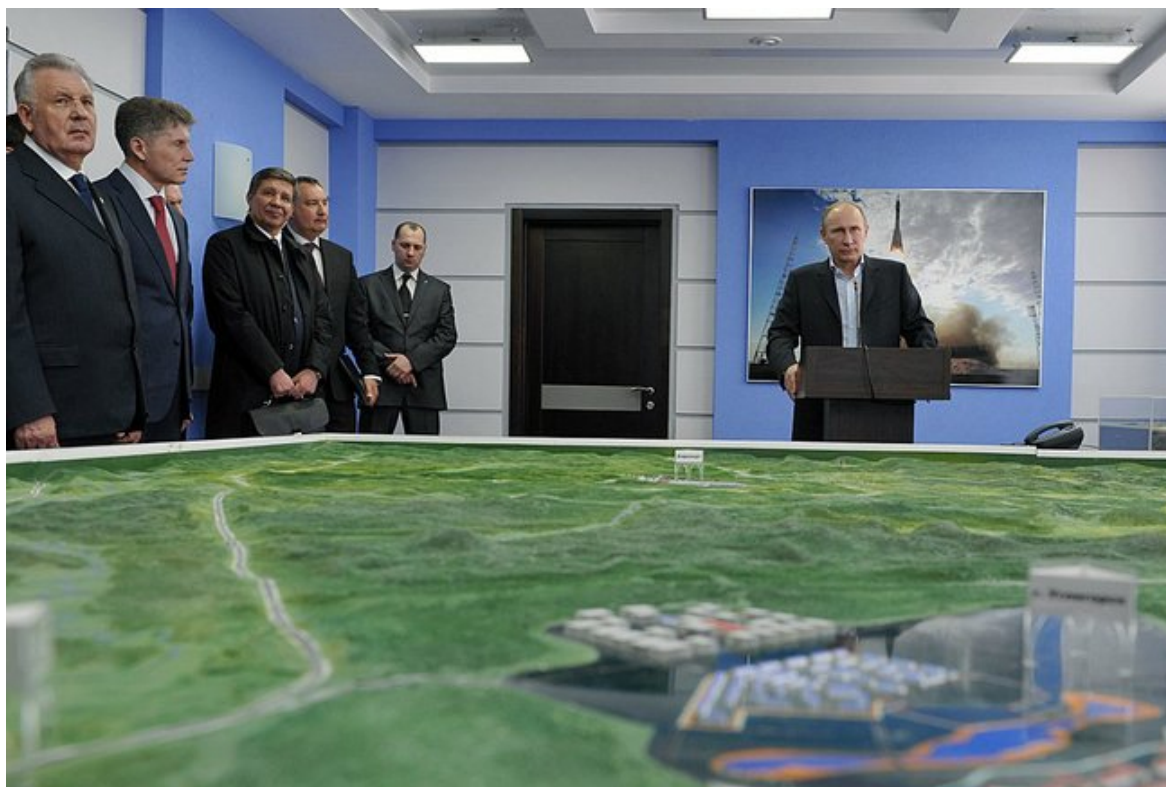
Putin at the Vostochny space facility in the Far East.

The project to build a space launch facility in the Far East is the most ambitious of its kind since the construction of Baikonur in Kazakhstan in late 1950s. Its completion will save Russia the annual $115 million cost of renting the launch pad from the Kazakhs.