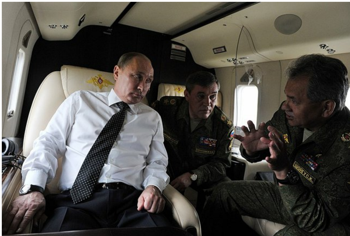
Putin with Chief of General Staff Valery Gerasimov (center) and Defense Minister Sergei Shoigu (right).

Zabaikalsk, which has abundant natural resources and access to the Trans-Siberian Railroad, is one of the poorest in the country. The unemployment rate is more than 10 percent, double the Russian average. Putin told local authorities that the way out is to develop entrepreneurial spirit and exploit the region's favorable geographical location.