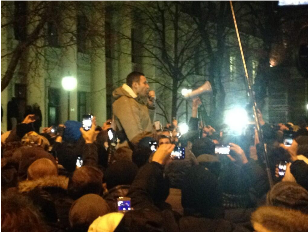
World champion boxer-turned-politician Vitaly Klitschko speaking to the crowd on Sunday night.