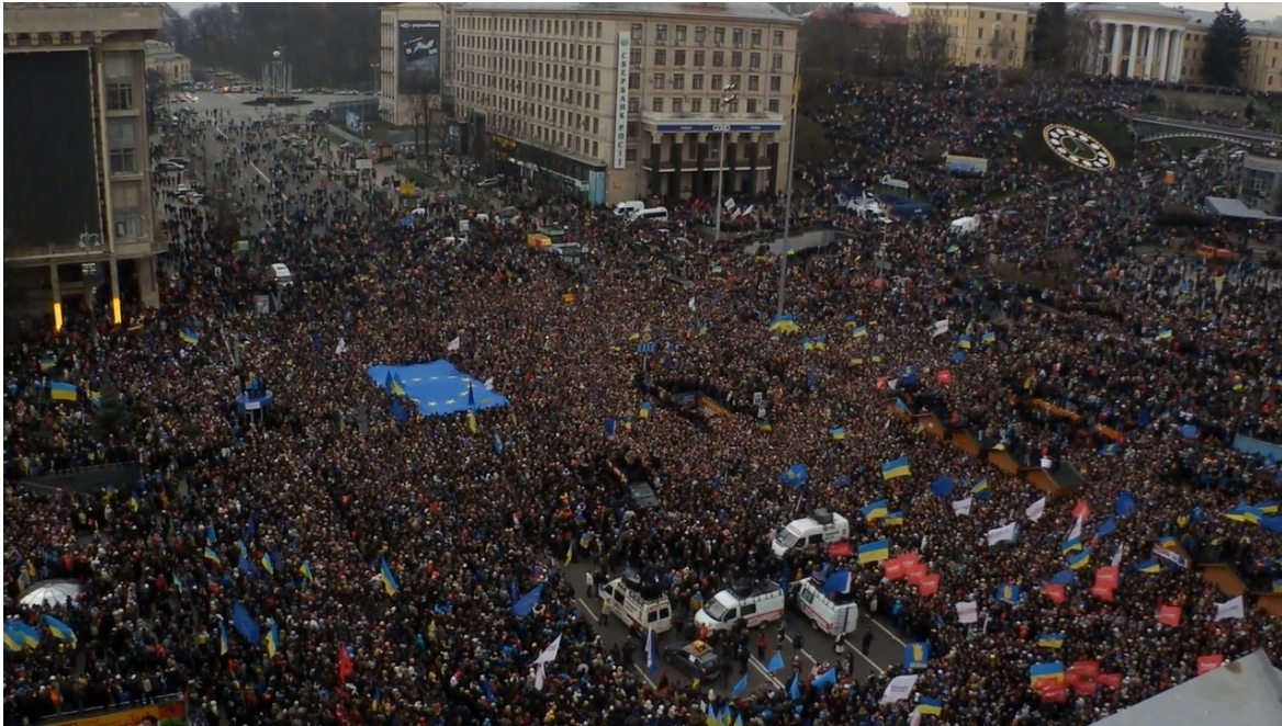
According to law enforcement agencies, only about 3,000 people turned out for the protest, though this picture shows otherwise.