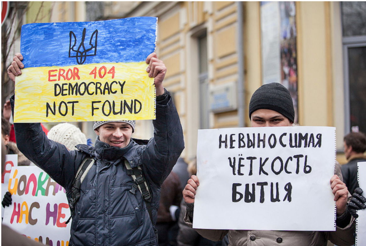
Protesters and their homemade signs.

Edit – A photo that incorrectly identified the Ukranian president was removed from the photo essay.