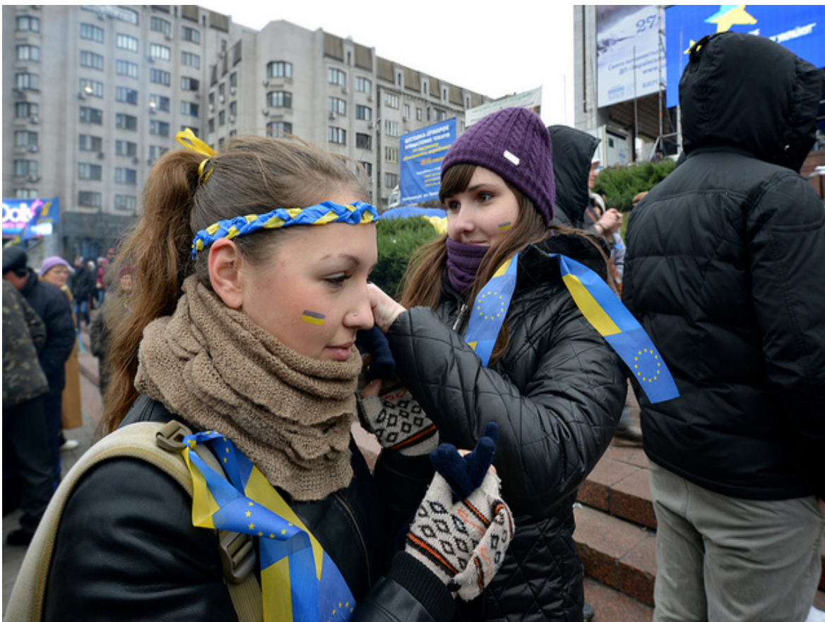
Getting ready for the march.