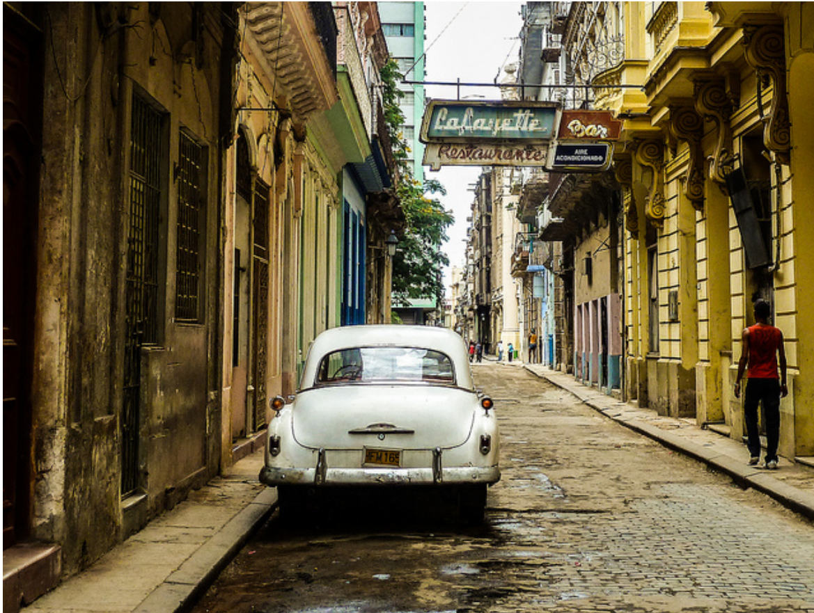
The old-world charms of Havana, Cuba.

Take a trip back into a past of pastel-colored houses and vintage cars for up to 30 days in Cuba. Aeroflot even flies direct from Moscow.