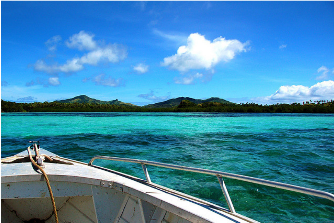
The islands and clear waters of northern Fiji. (airpanther / Flickr)

Feel like floating around the Pacific for a while? Russian citizens can head to Fiji for 4 months with a return ticket and proof of funds. Guam, Micronesia, and the Cook Islands could make interesting stops along the way.