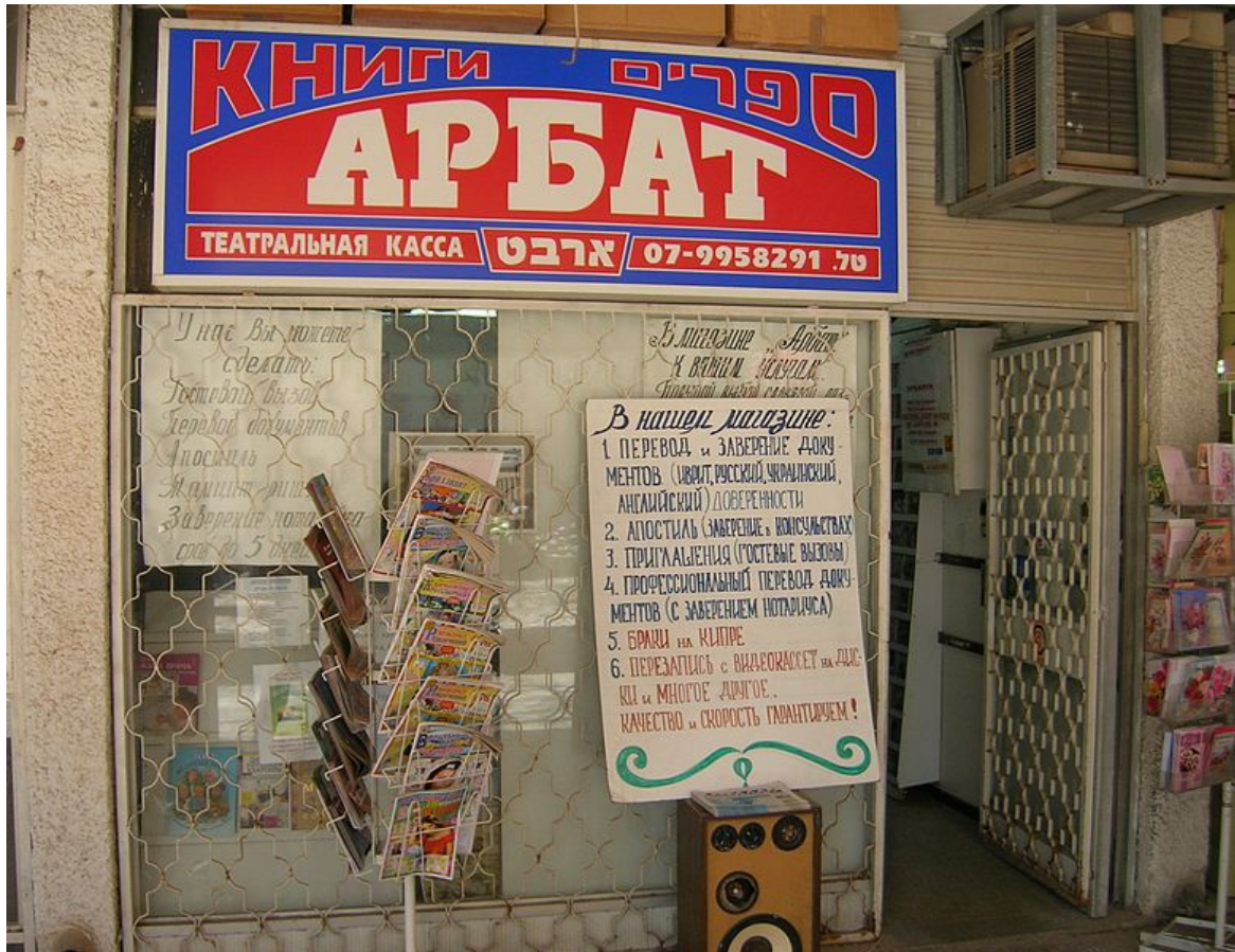
A Russian bookstore in Arad, Israel.

If you really need the company of other Russians during your holiday, there's always Israel, where the amount of Russians who vacation or have migrated there can help you feel right at home for up to 90 days. Furthermore, Russian is the second most widely-spoken foreign language after English in Israel.