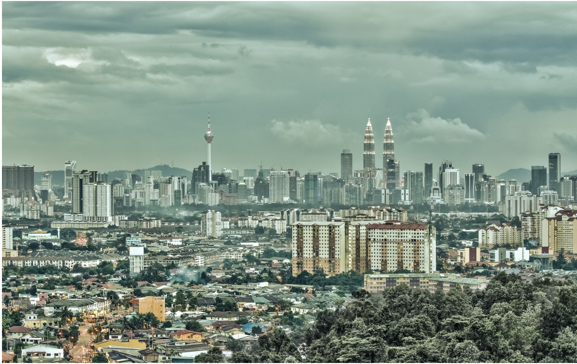
Kuala Lumpur, the capital of Malaysia.

A visa-free Southeast Asian beach holiday can be arranged with a Russian passport, which allows access to Malaysia for 30 days, Thailand for 30 days, Laos for 15 days and Vietnam for 15 days. Singapore also allows 96-hours visa-free transit, which should give tourists enough time to explore a large chunk of the small island nation.