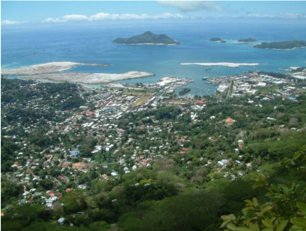
Port Victoria, the capital of Seychelles.

An island archipelago in the Indian ocean, Seychelles is the least-populated African state. It is also a favorite getaway for Russian oligarchs, who be there for up to 30 days without a visa.