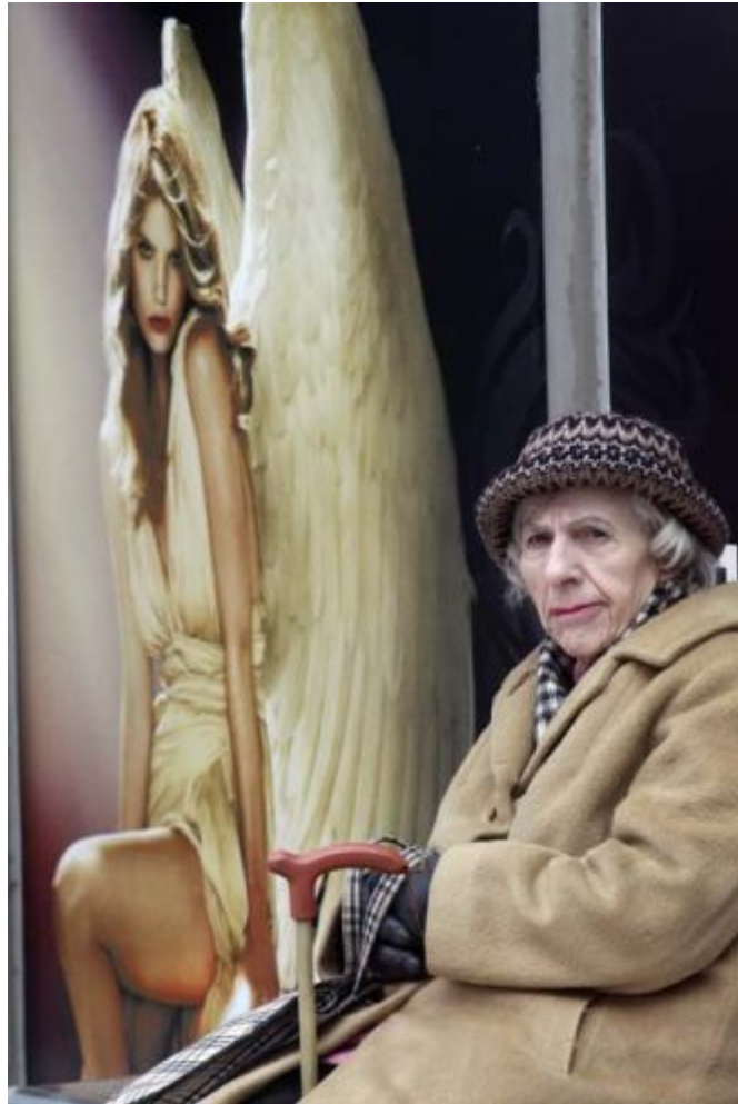
An elderly woman waiting at a bus stop next to an advertisement.

7. "Face control" becomes a regular word in your vocabulary.