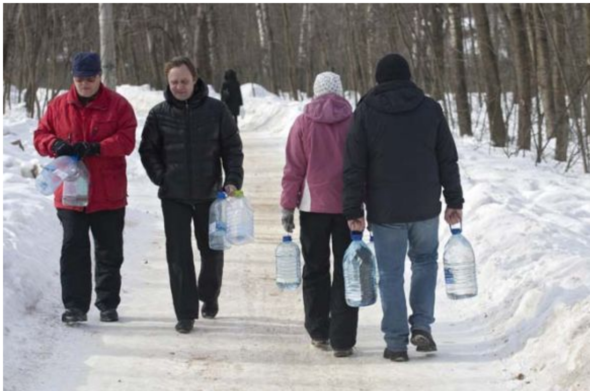
Locals carrying fresh water back home from a spring in the Pokrovskoye–Streshnevo district of northwestern Moscow.