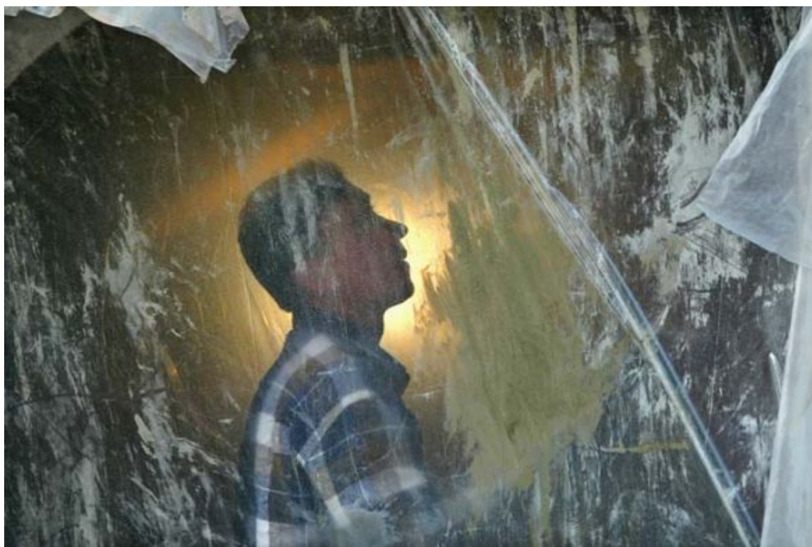
A worker refurbishing an apartment on Tverskaya Ulitsa. Heated arguments and violent fights have erupted in apartment buildings over neighbors whose renovations never seem to end.