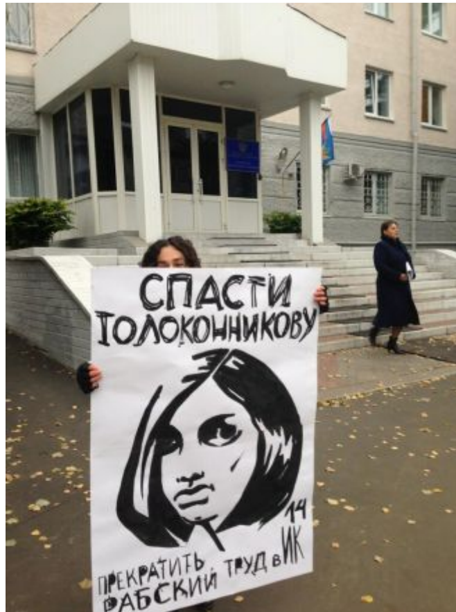
A Pussy Riot supporter holding a one-person protest outside the prisons office Thursday. The sign says, "Save Tolokonnikova. End Prison Slave Labor."

Tolokonnikova and a fellow band member are serving two-year sentences in separate prisons after being convicted of charges of "hooliganism motivated by religious hatred" for taking part in an anti-Putin performance in Moscow's Christ the Savior Cathedral in February 2012. The sentence is widely seen as politically motivated, and Pussy Riot has won widespread support abroad.