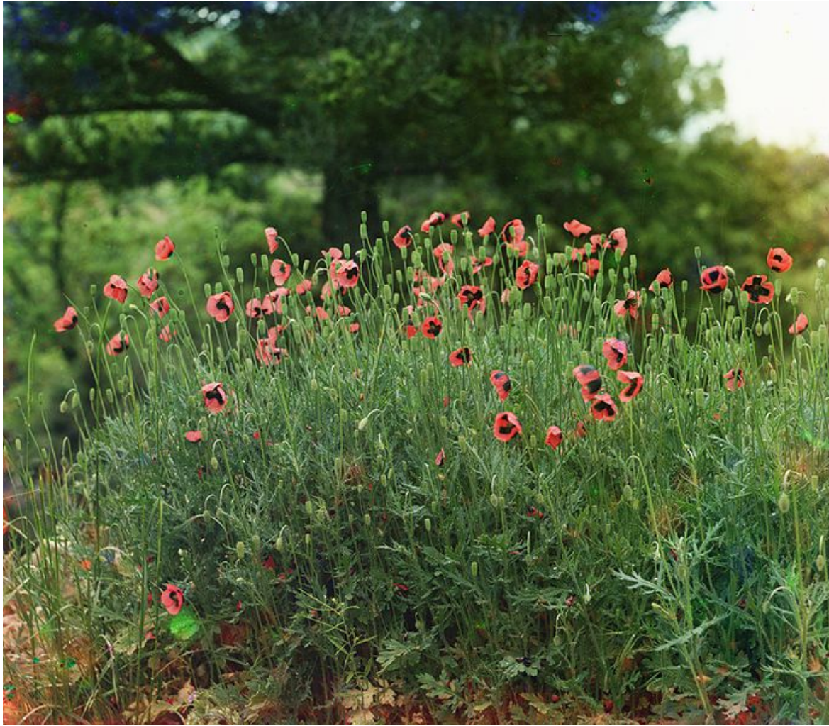
Rogue poppies on your dacha could land you in trouble

Dacha owners also have reason to fear the Federal Drug Control Service. The Moscow Times reported in 2004 that a Moscow woman faced up to eight years in prison after drug police raided her country home and confiscated 500 poppies growing in her garden as part of "Operation Poppy-2004."