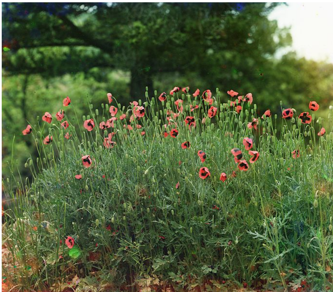
Rogue poppies on your dacha could land you in trouble

Dacha owners also have reason to fear the Federal Drug Control Service. The Moscow Times reported in 2004 that a Moscow woman faced up to eight years in prison after drug police raided her country home and confiscated 500 poppies growing in her garden as part of "Operation Poppy-2004."