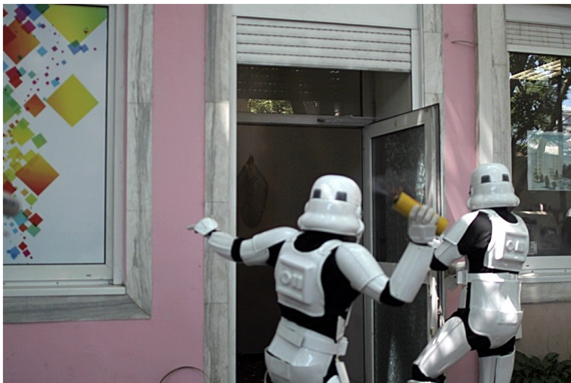
The vigilantes attacking the smoke shop, submitted by users of the news service Dumskaya.

In their own fight against the dark side, a squad of rogue intergalactic stormtroopers from the collective known as the Internet Party of Ukraine, raided a cafe in Odessa earlier in 2013 in search of illegal herbal drugs, throwing smoke bombs and setting the venue on fire.