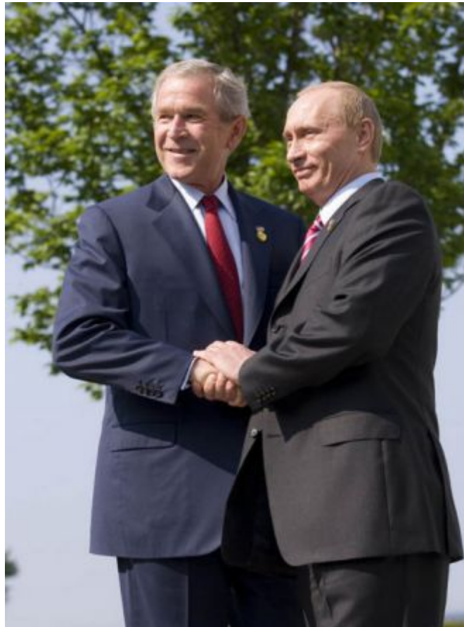
George W. Bush and Putin attending a G8 summit in Germany in 2007.