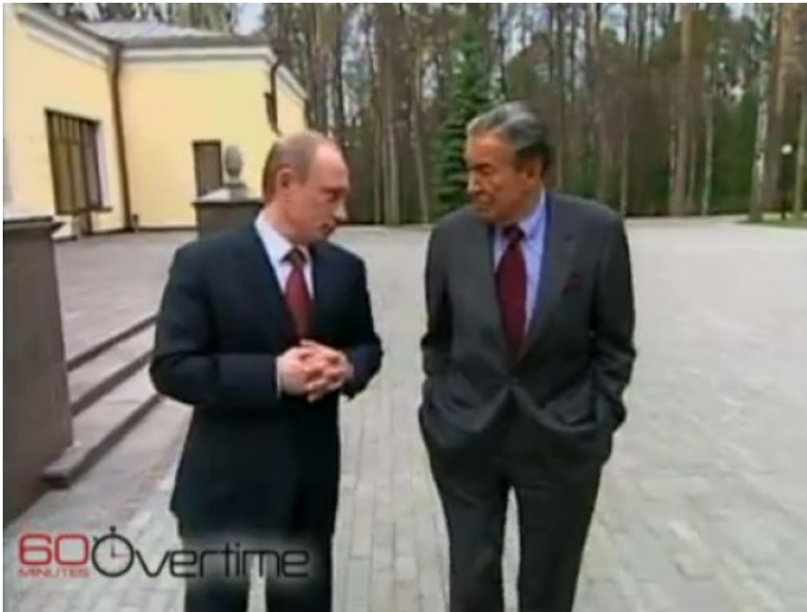
A TV image of Mike Wallace with Putin at the presidential residence outside Moscow in 2005.