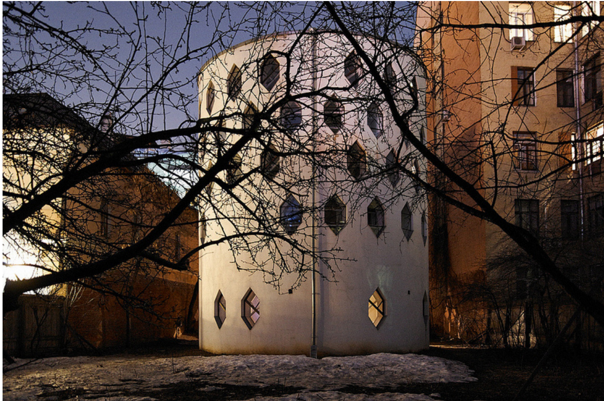
The Melnikov House in Moscow's Arbat district completed in 1929 is one of the many examples of architectural masterpieces under threat in Moscow.

Russia and Moscow's constructivist legacy is not held in high regard by locals, despite its worldwide appeal. Historical buildings without status are at the mercy of developers. As a result, many architectural landmarks are falling into disrepair and are being torn down, exacerbated by large scale redevelopment in the city center.