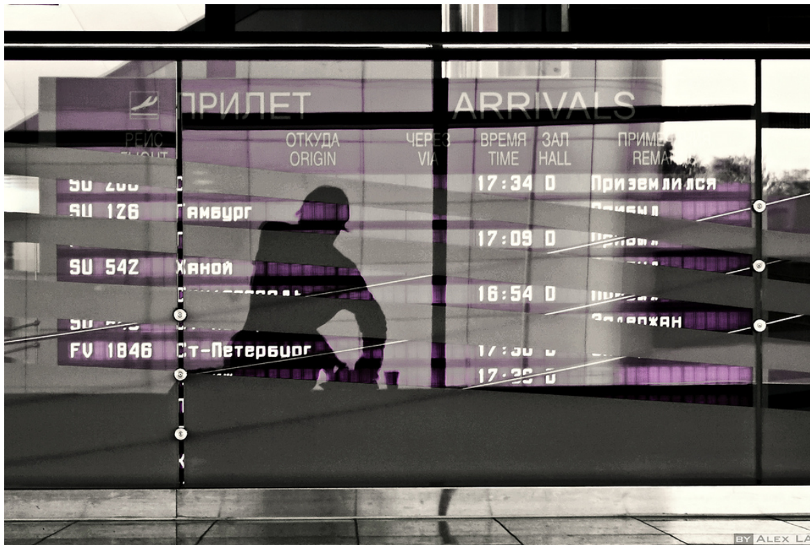
Migration policy needs to be updated to meet current labor market realities, especially in Moscow.

Both employers and their workers might look at the current situation as "uniquely Russian," and must certainly spend a significant portion of their social time discussing loopholes in the system and sharing success stories and tips around it, but the reality is that a more responsive system is necessary, especially in the context of a rapidly changing workforce and working culture to allow more qualified foreigners that are not necessarily executives or managers, to work in Moscow.