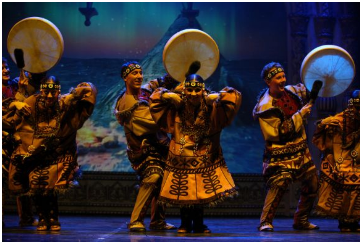
Dancers in ancient costumes gyrating to powerful drumbeats on stage. (Kostroma)

decorated costumes are used in the show, which also features 300 props and eight set changes. The troupe of fifty dancers only adds to the grandiosity of the performance and is befitting of any tribute to a land as large as Russia.