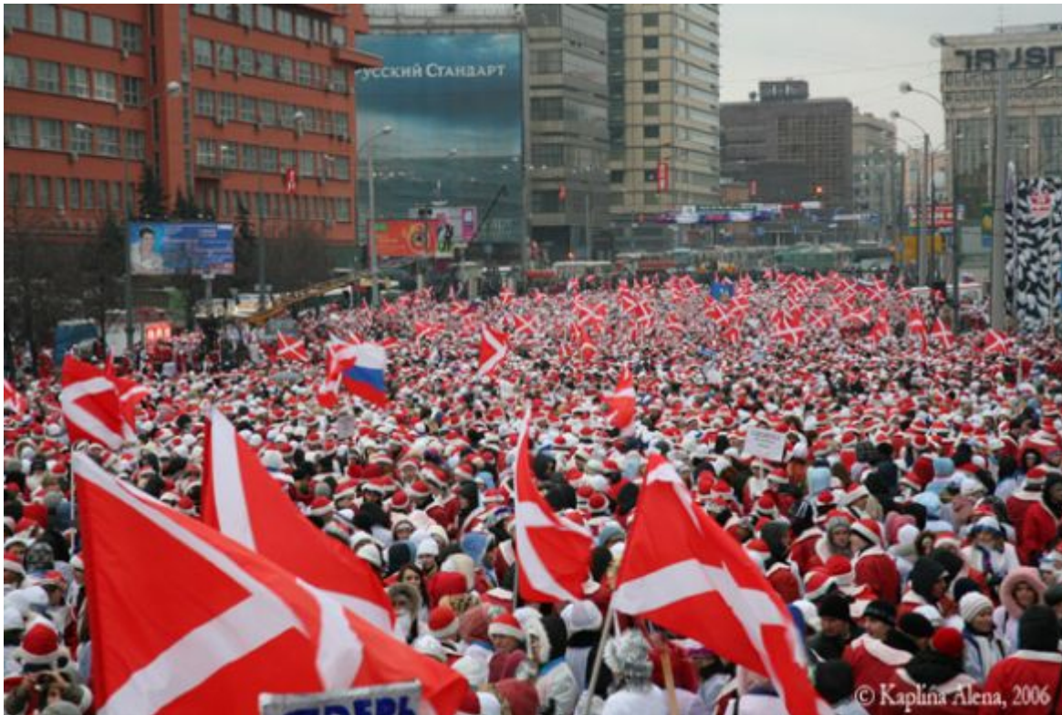
A rally by supporters of Nashi, Surkov's brainchild, in Moscow in 2006.

3. Renowned as the author of the term "sovereign democracy" to describe the political system he helped build in Russia, Surkov also created the Just Russia party, the now-defunct Rodina party and the pro-Kremlin youth group Nashi, observers say. Nashi was known for its attacks on and harassment of opposition politicians and foreign diplomats.