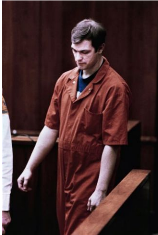
Jeffrey Dahmer entering a courtroom in 1992.