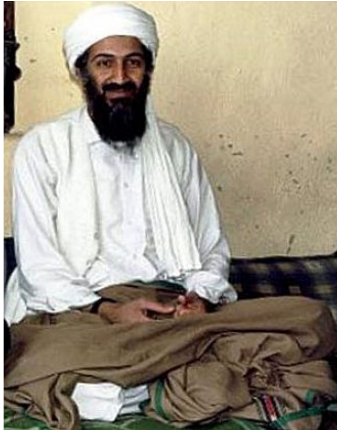
Osama bin Laden circa 1997-98.