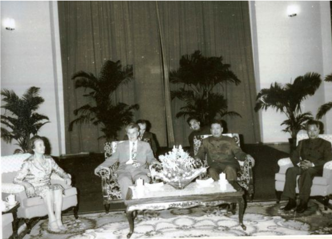
Pol Pot, center right, meeting Romanian President Nicolae Ceaucescu in 1978.