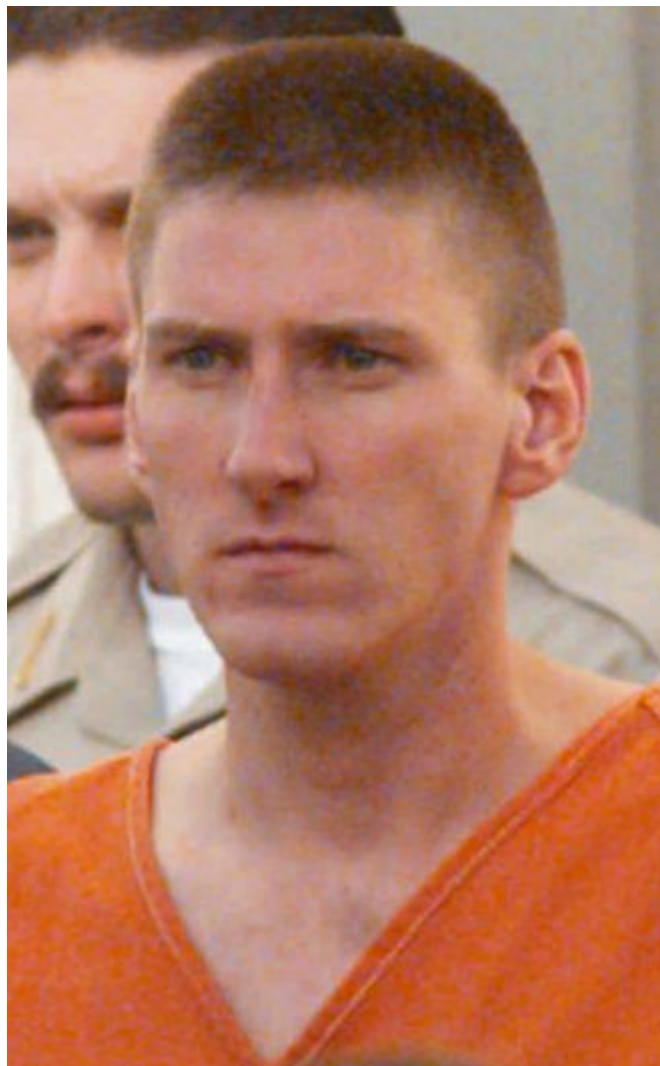
Timothy McVeigh.