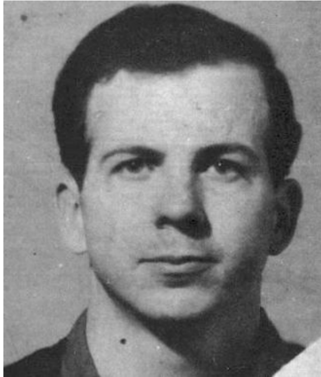
Lee Harvey Oswald in Belarus.

In a letter to The Buffalo (New York) News, McVeigh had said he wanted his ashes scattered at a secret location.