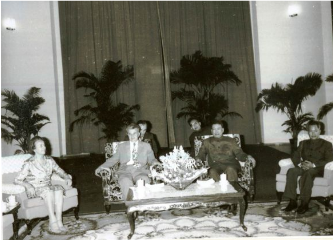
Pol Pot, center right, meeting Romanian President Nicolae Ceaucescu in 1978.