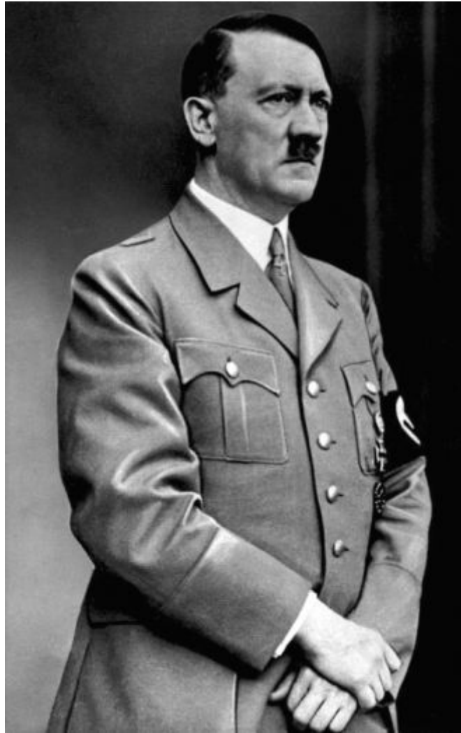
Adolf Hitler.