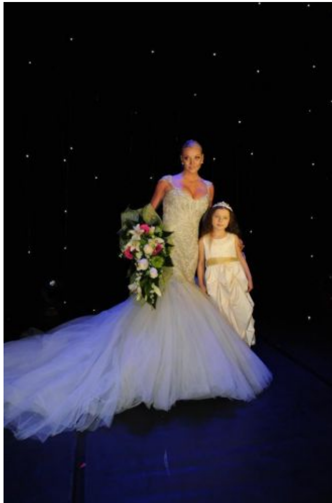
Volochkova attending her 37th birthday party with her 7-year-old daughter early this year.

The girl was left shaken, Volochkova tweeted, adding, "Even I'm afraid to return home."